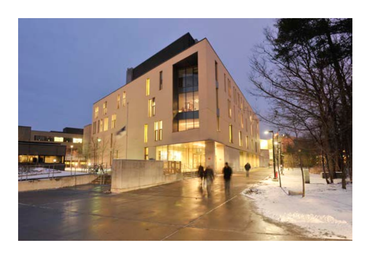
February 11, 2015