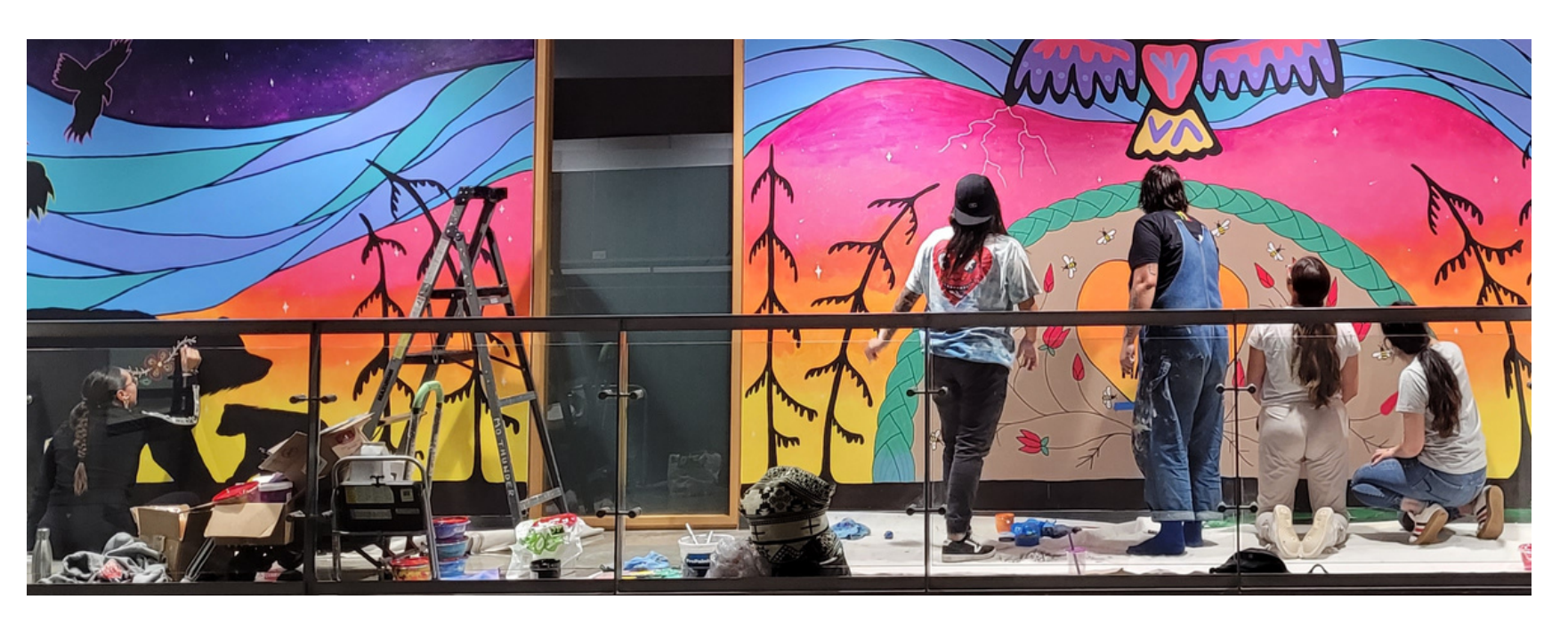
Every Child Matters