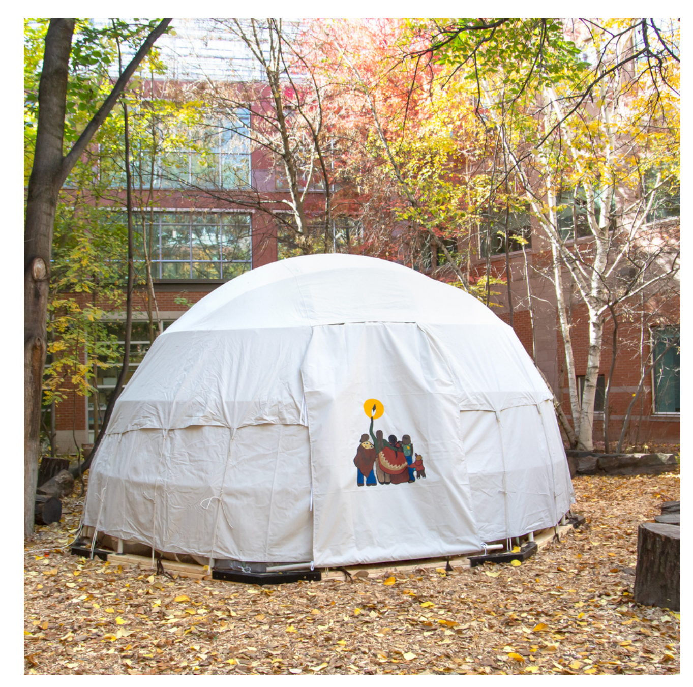
First Nations House Indigenous Student Services Teaching Lodge