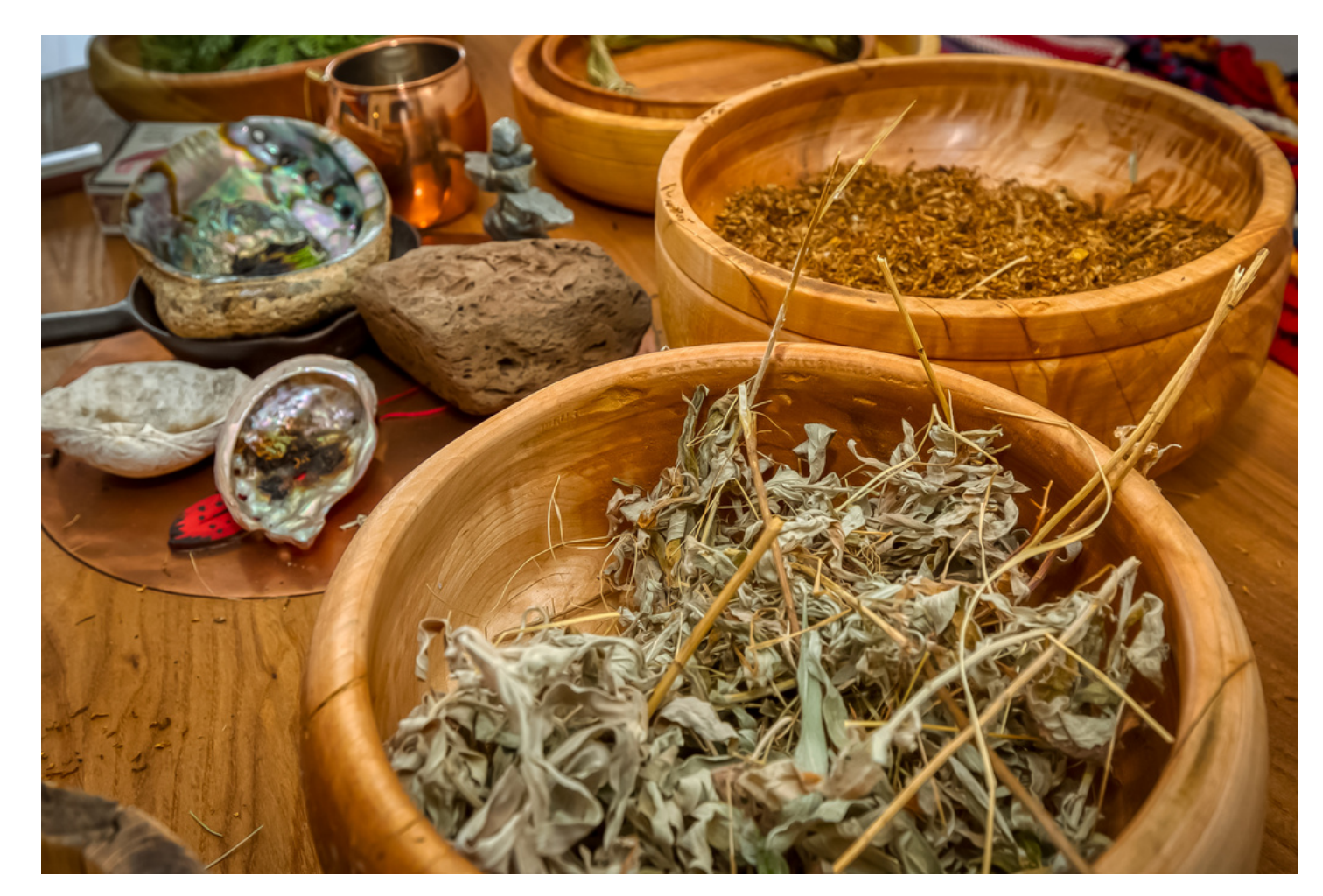
First Nations House Indigenous Student Services

With a full return to campus, 2022 brought our communities back together after many years of separation and isolation.