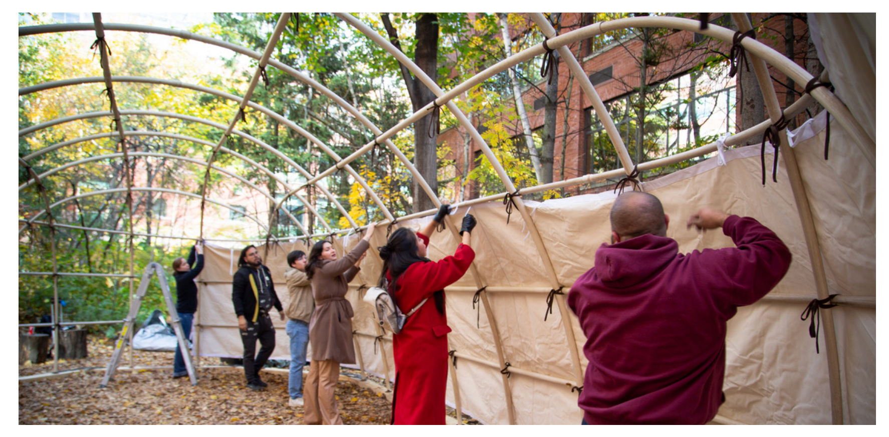
Staff and Students raise the First Nations House Teaching Lodge