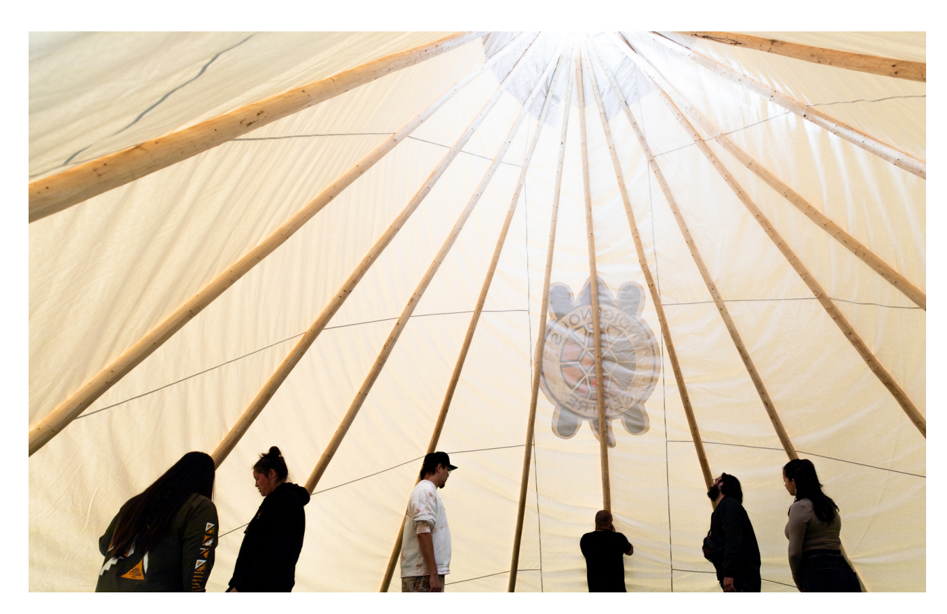
Students, staff and faculty gather at the UTM Tipi raising