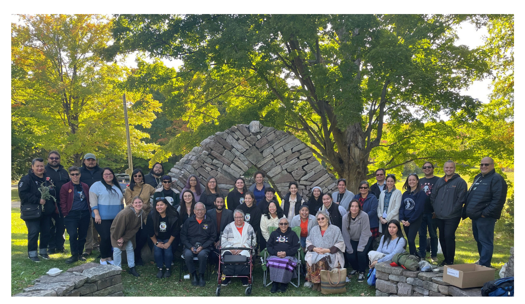
Indigenous staff, faculty, librarian and student gathering at Hart House Farm, Fall 2022