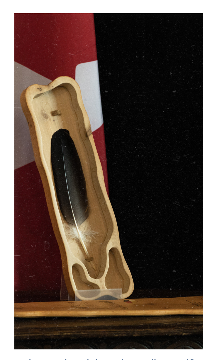
Eagle Feather