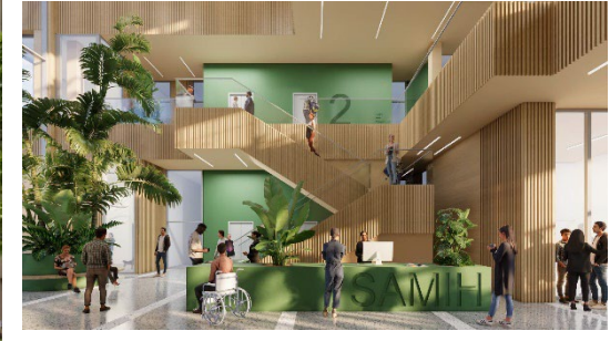
LAMP (CENTRE FOR LITERATURES, ARTS, MEDIA AND PERFORMANCE)